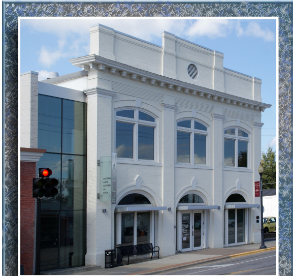
Apex Historical Society 25th Anniversary - Oct. 14, 2012 100-Year-Old Former Town Hall is Venue

History comes to life as we walk the streets and read the historic markers on the buildings. The Depot, the Town Hall, punctuated by the Red Caboose, serve as reminders of what brought people and a way of life to this pine tree covered piece of earth. Notecards are available.