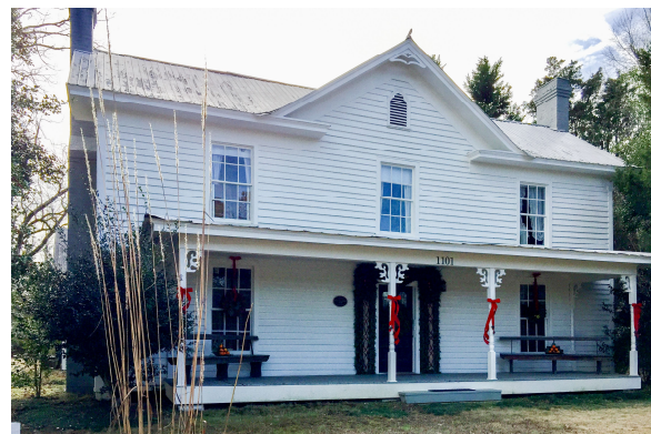
Maynard-Pearson House, Built 1870, Decorated for the 2019 Home Tour.