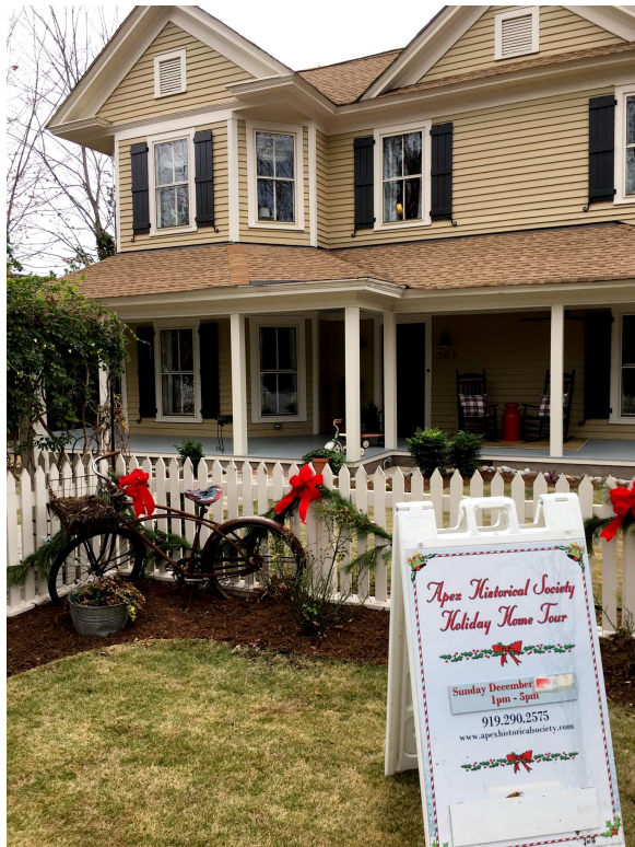
Rogers-Fike House, Built 1906