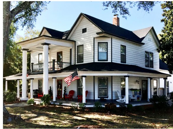
Hunt-Bridges House, Built 1912.