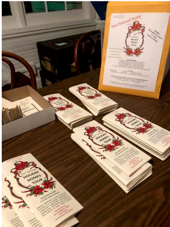
2019 Home Tour Brochures ready for distribution.